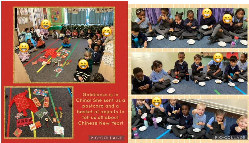
Reception have loved exploring Chinese New Year. They've tried Chinese food, made paper lanterns and had lots of fun dragon dancing.