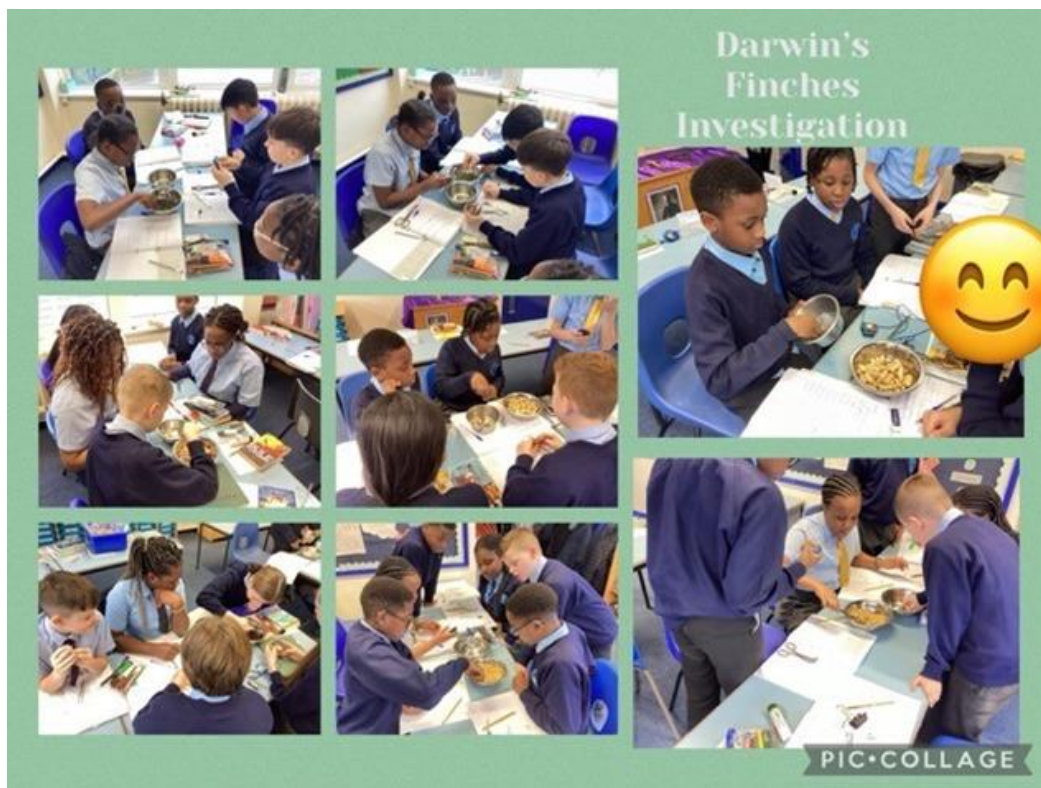
Year 6 designed and carried out a science investigation to explain Darwin's Theory of Evolution. They used a variety of instruments to represent different shape and size beaks to show how finches adapted to the available food.